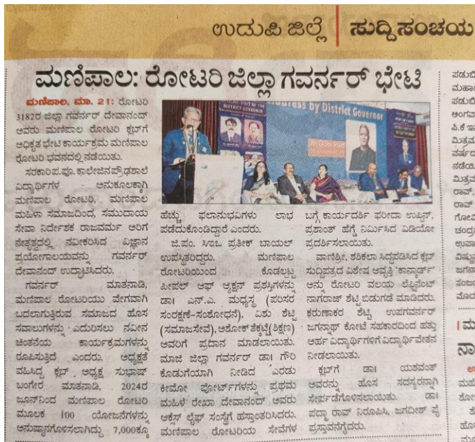
Udayavani Newspaper dt 22.03.2025: DG Visit to RCM Manipal